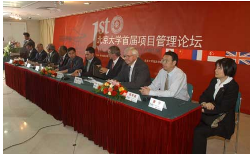
The IPMEU founding members at the signing ceremony.